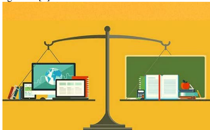
Figure 1. Balance online and offline teaching

teacher is in the classroom teaching. To answer the students' problems in self-learning, and to encourage students to grasp the application of course knowledge in the solution of questions, and then enhance the teaching effect [1].